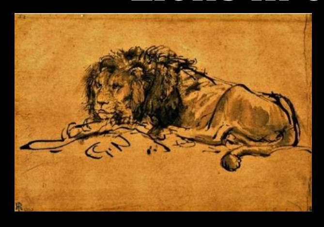
Rembrandt van Rijn, circa 1650, Louvre