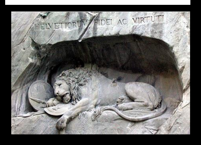
The Lion of Lucerne in Switzerland