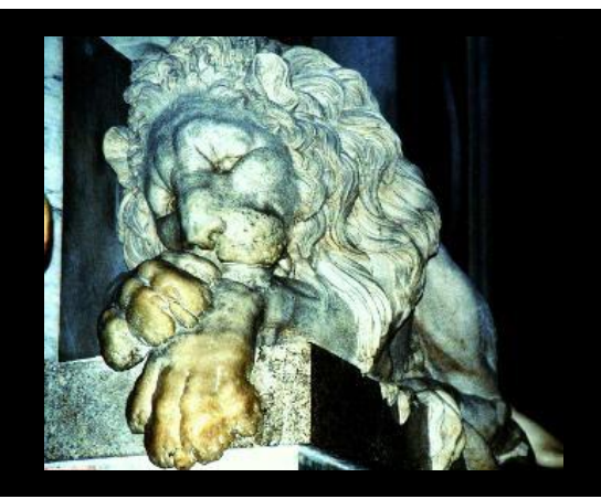
Lion in St Peter's Square, Vatican