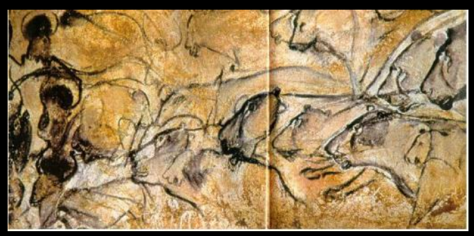
The Chauvet Cave Lions, painted 30,000 years ago