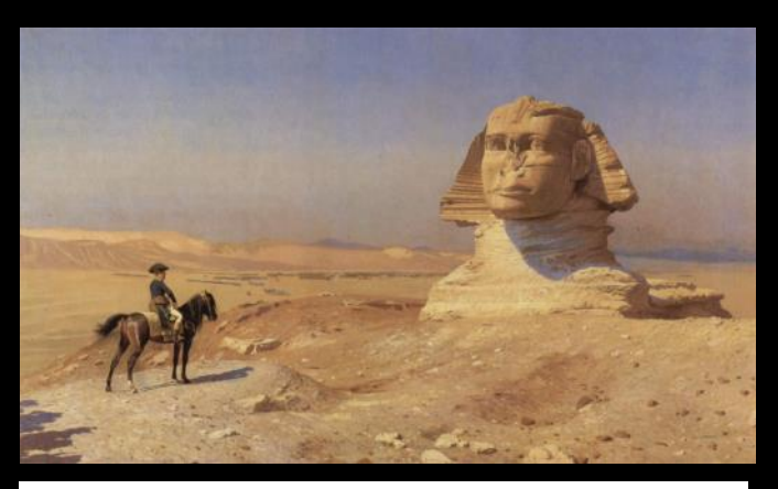
Napoleon and the Sphinx - Jean Gerome, 1868