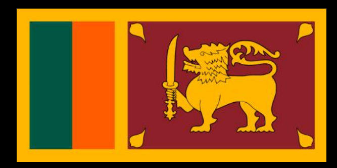
The Flag of Sri Lanka